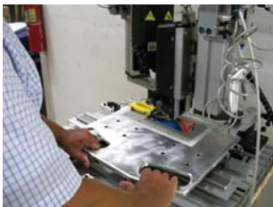
The R9's movable jig allows for absolute positioning of any Elastic Staple